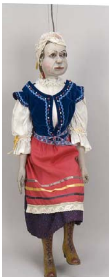
Image of puppet