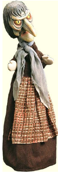
Image of puppet

Then, put the information in the right place in the table to complete the description of the puppet.