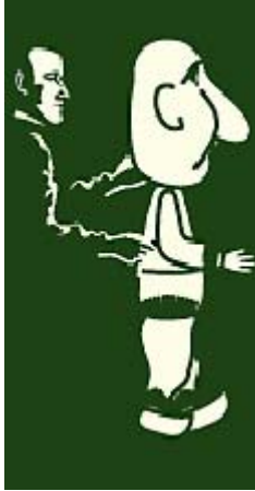
Frontal Manipulation Puppet

These images illustrate the different ways of manipulating puppets. Puppets are named for the way in which they are operated. Match each image to the right name.