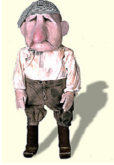
Frontal Manipulation Puppet